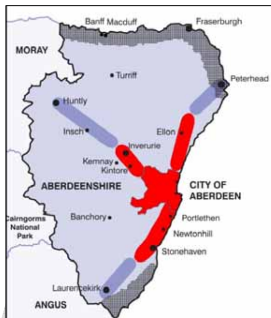
Figure 1: SGAs in the Aberdeen Housing Market Area

3.2 Aberdeen and the SGAs nearest the city are highlighted in Figure 1, with specific allocations and intervention areas shown in Appendix 3. Within the local growth and diversification areas, the level of growth is related to local needs and development is unlikely to have an impact on the wider transport network; sites in such areas will not generally be expected to contribute. The requirements for contributions for each type of development are set out in Appendix 4. There may also be instances where a change of use application requires a contribution to the strategic transport fund.